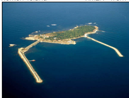
TA - Kefken Island (AS-159)

TA - Pavel/TA2ZAF (OK1MU), Slavek/OK1TN and Dan/OK1HRA will be active as TC0W from Kefken Island (AS-159) on 7-11 June. They will operate CW and SSB on 40-10 metres. QSL via OK2GZ, direct or bureau. The web site for the operation is at http://www.okdxf.eu/expedice/tc0w/