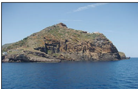
I - Ustica Island (EU-051)

ISO - IK2DUV and IK2UVT will be active as IM0/homecall from Sant'Antioco Island (EU-024, IIA CI-010) on 12-23 June. They will concentrate on 6 metres. [TNX IK2DUV]