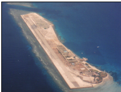
9M - Layang Layang, Spratly Islands