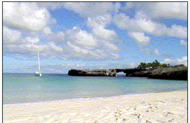
YV - La Blanquilla (SA-037)