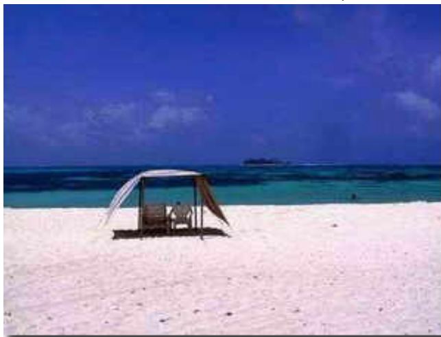
HK0GU Central Beach with Johnny Cay in the background

SM - Special calls SC0AG, SC1AG (Gotland Island, EU-020), SC2AG, SC3AG, SC4AG, SC5AG, SC6AG and SC7AG will be aired throughout the year to celebrate the 30th anniversary of the Scandinavian CW Activity Group (SCAG). QSL via operators' instructions. A special award will be issued, information will be available at http://www.scag.se [TNX SM1TDE]