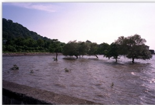
ATOBI – Elephanta island

VU - Basappa/VU2NXM and Arasu/VU2UR plan to operate, possibly with a special call, from Elephanta Island in the unnumbered Maharashtra State group (AS-???) on 25-31 March. They hope to receive the final authorization in the next few days. [TNX VU2UR and VU2NXM]