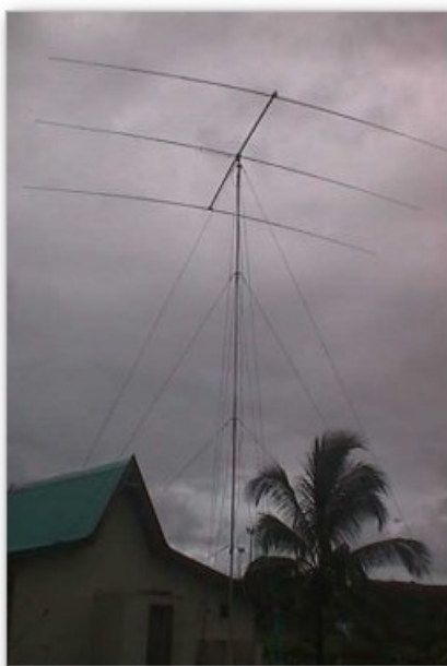
3B9C - 20m beam