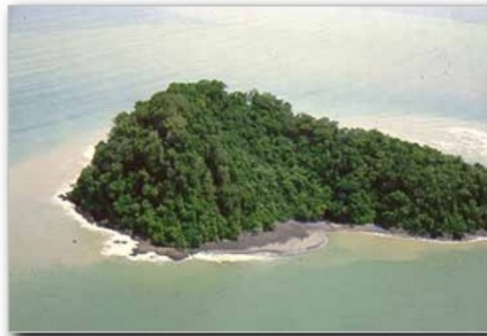
9M8PSB - Pulau Satang Besar

5H - Eric, SM1TDE will operate (mainly CW with some RTTY and SSB) as 5H3/SM1TDE from Tanzania on 4-18 April. A side trip to Zanzibar (AF-032) might take place during the second week. QSL via home call, direct or bureau. [TNX SM1TDE]