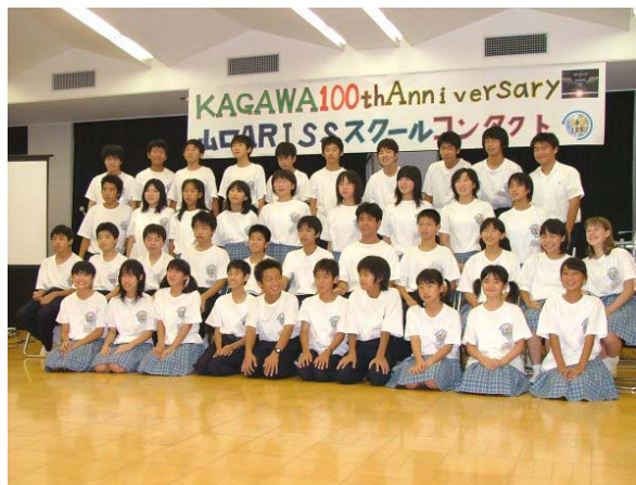
The Kagawa, Japan school contact on September 20 was extremely successful. 13 students asked 15 questions to Ed Lu on ISS. This was the first contact in Yamaguchi Pref