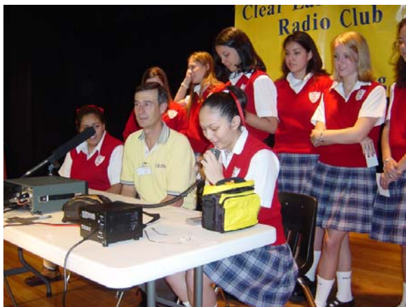
Ten students at a Houston Texas high school had a chance to talk to Astronaut Ed Lu aboard the ISS this week.

(a) Rest of the world (b) North, Central, South America, the Caribbean (c) ILLW 2002 and 2003 only (d) WAG Contest 2001 only (e) August 2003 only (f) Direct (g) Bureau