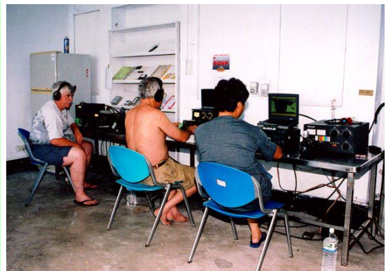
No dress code required in the shack. Displaying our back side whilst talking to you face to face on the bands