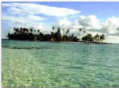
5J0X - San Andres Island

HK0_sa - The Florida DXpedition Group's team for the 20-28 October activity from San Andres Island (NA-033) [425DXN 623] includes K4QD, KR4DA, N1WON, N2WB, W1LR, W4WX and W9AAZ. They will operate as HK0/homecall (QSL HK0/N2WB via N200, others via home calls) on 160-6 metres CW, SSB, RTTY, PSK31 and Hellschreiber. Look for 5J0X (QSL via N1WON, direct or bureau) during the CQ WW DX SSB Contest as a Multi-Two entry. Logs will be available on LoTW. The web pages