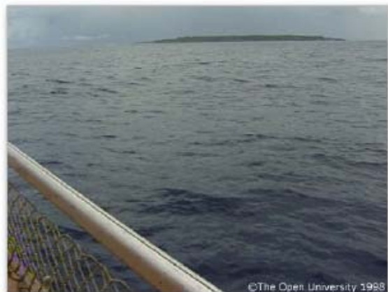
T33 – Banaba island