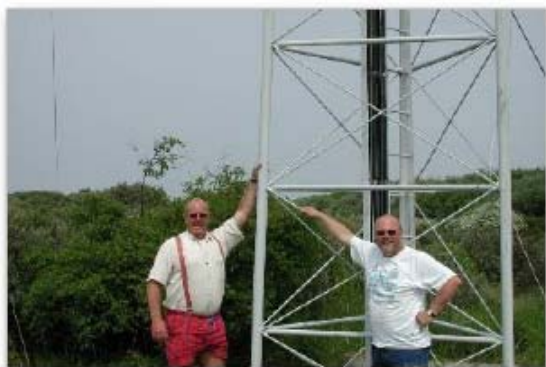
PA3BAG and PA0VHA

4W - Yuu/JR2KDN, Yasu/JI1NJC and Shu/JH1SWD will operate as 4W2A (QSL via JR2KDN), 4W1SW (QSL via JI1NJC) and 4W4W (QSL via JI1NJC) from Timor Leste on 22-28 October. They will be active on 160-10 metres SSB, CW and RTTY. They will also be QRV on 6 metres (beacon on 50095 kHz) and via AO-40 satellite; Yuu, JR2KDN/4W2A hopes to participate in the CQ WW DX SSB Contest. [TNX JA1ELY]