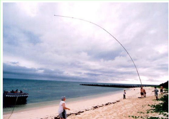
Trying to get up the V160 on the beach