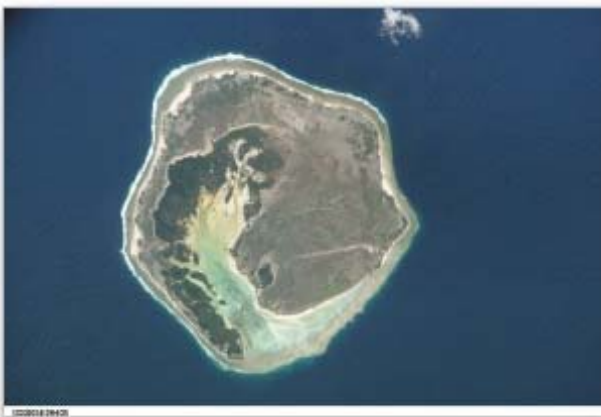
FR/E – Europa island from the space