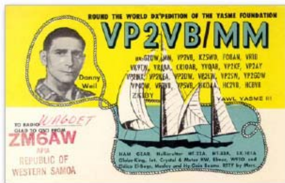
VP2VB/MM-Last standard QSL