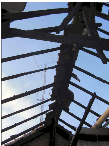
How would you feel if you looked at your antenna from this perspective? Help Kadek!

FX4S1X I Thanks to Claude/F5GTW, this French 6m beacon is QRV again on 50315 kHz. It is located west of Poitiers (JN06cq), and it runs 25 watts into a 5 element yagi pointed to east. Reports can be sent to F5GTW. [TNX F5NQL]