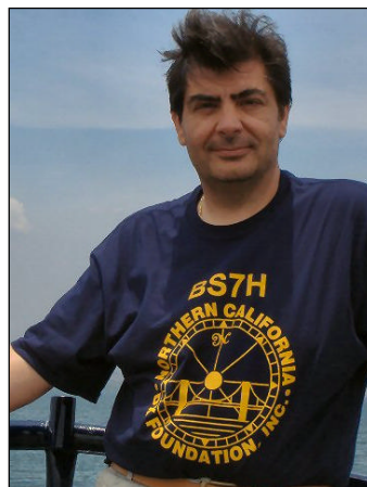
Italy's Envoy Extraordinary Massimo Mucci, I8NHJ