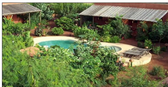
Le Calao amateur radio shack