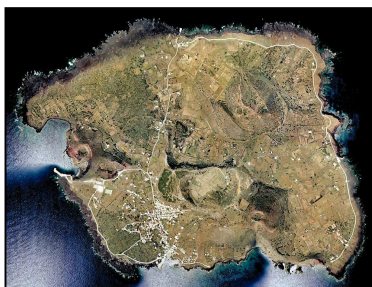
Linosa Island (EU-017)