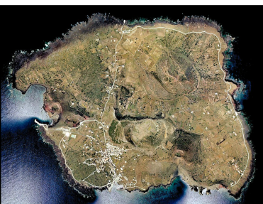
Linosa Island (EU-017)