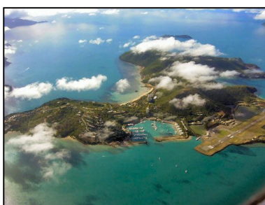
Hamilton Island (OC-160)