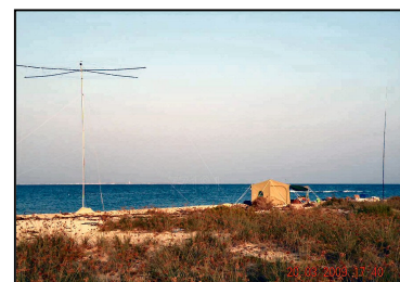
HZ1FS/p Hibar Island (AS-192)