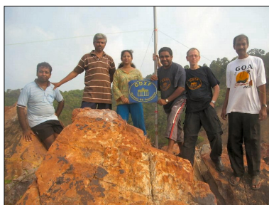
The AT9RS team on Grandi Island (AS-177)