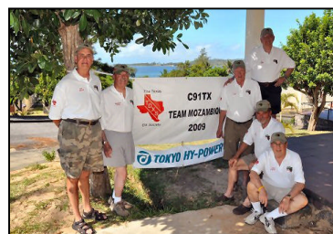
The C91TX team