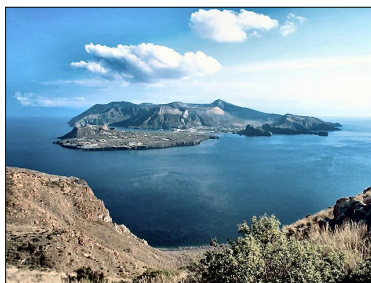
Vulcano Island (EU-017)

JT - JH1AWN and three members of the Akita DX Association (JA7AGO, JA7LU and JA7ZP) will be active from Ulaanbaatar, Mongolia on 21-28 April. They will operate CW, SSB, RTTY and PSK31 from two different locations, JT1KAA's shack and their hotel. Plans are to be QRV on 160-6 metres, but 160m activities will depend on local conditions. The call signs and relevant QSL routes are: JT1AWN via JH1AWN, JT1AGO via JA7AGO, JT1LU via JA7LU, JT1ZP via JA7ZP. Cards can be sent direct or via the JARL bureau. [TNX JA1ELY]