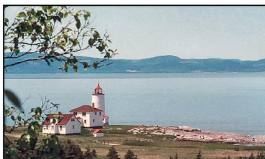
Ile Verte (NA-128)