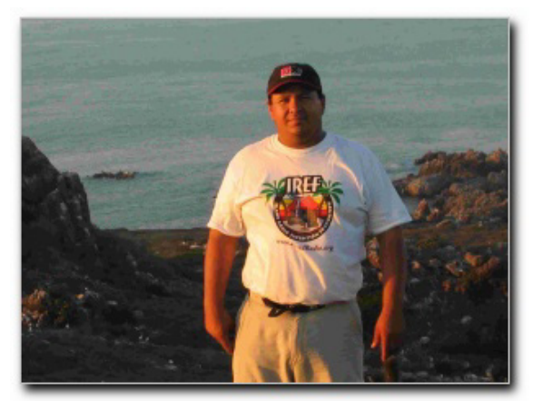
XE2K on hike