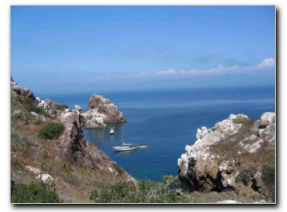
Weekend Sailors visit the island