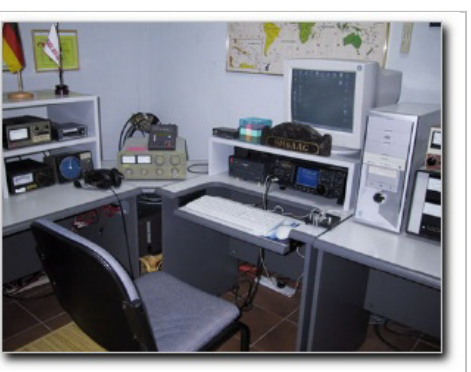
9M6AAC main station