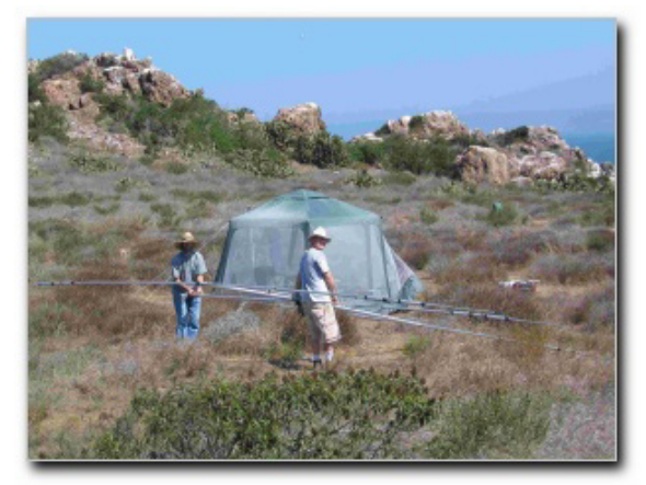
N6AN (XE1NTT) & N6KZ with TH3