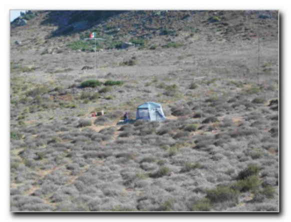
XE2ED and operating tent