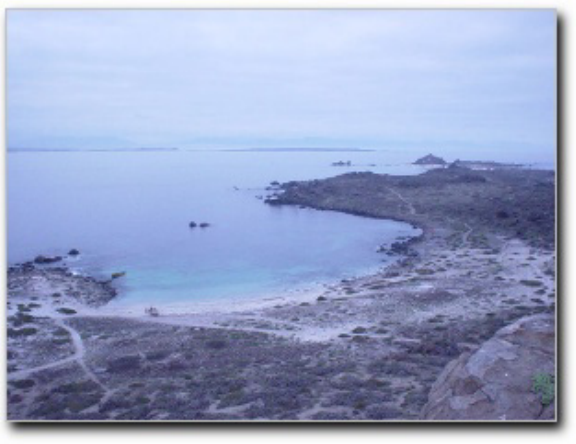
3G2D - Damas island

LABRE-RJ : The new web site for Rio de Janeiro State federation of LABRE (Liga Brasileirade Radioamadores) is at <u>http://www.labre-rj.org</u> [TNX PY1XP]