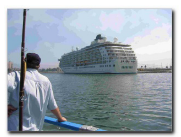
Leaving the island