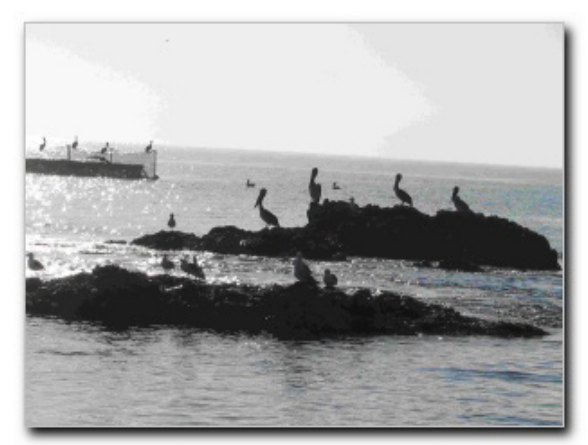
Pelicans on rock

The results of the XF1K operation were most satisfying considering the only fair band conditions. 10m and 12m never opened.15m opened to Europe and Asia for only several hours a day. We had one very good European opening on 17m with over 100 Europeans on CW. 20m of course, was our best band to all areas of the world. 30m was a pleasant surprise with 700 contacts, many in Europe and Asia. 40m was our band to Asia, 65 percent of the QSOs were with Japan. 80m produced only 60 contacts in the US Sprint contest. The VHF/UHF operator had (31) 2 & 6m contacts, and (30) AO7, AO40 & SO50 contacts. The continent and mode breakdown is as follows: