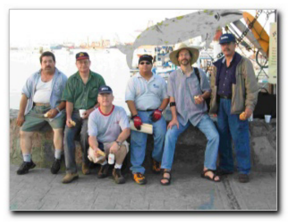
XF1K crew at dock

Despite the long drive, the sea voyage, and the difficult conditions encountered setting up the two operating locations (heat, sun, and limited access to drinking water) the equipment and antennas seemed to be working well. Stations were quickly worked in EU, JA, and, of course, all over the US and Canada. The remaining three days fell into a slow, hot routine of operating, eating, sleeping and enjoying the Pacific Ocean views. N6VR was even able to go fishing with the island crew and bring home enough fish for an evening meal.