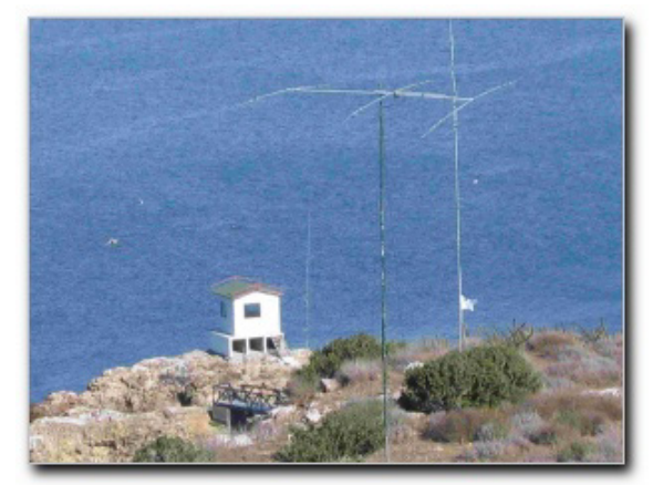
View of antennas