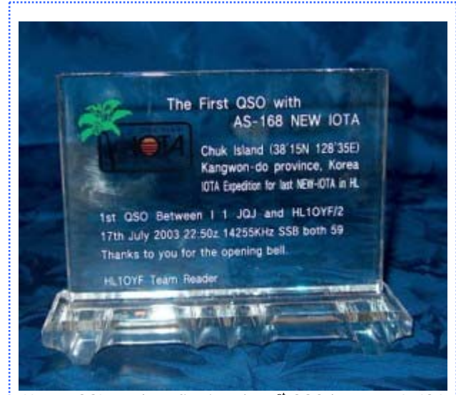
Heavy QSL card confirming the 1<sup>st</sup> QSO between I1JQJ and HL10YF/2 from Chuk Island AS-168

YU1SB Bozic Slavko, Jurija Gagarina 196/50, Novi Beograd, Serbia and Montenegro