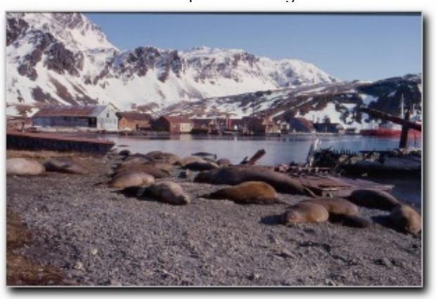
VP8SGK: Looking towards Grytviken