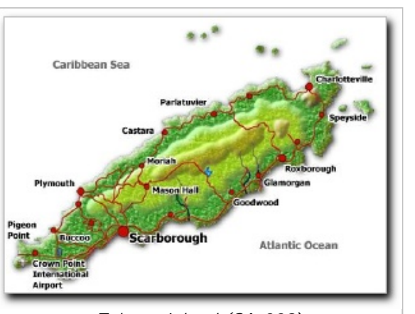
Tobago Island (SA-009)

run through 15 December. Some 15300 QSOs have been made so far (5800 SSB, 7700 CW, 1800 RTTY and 6 QSOs on 6 metres with ZS stations), plus 4000 QSOs logged as TO4WW during the CQ WW DX CW Contest. The new QRV times are 06.00-07.00 UTC and 15.30-19.45 UTC: the operators will try to spend more time on the bands, but the generators are not under their control, and they have necessarily to obey orders. The main station is now being used for SSB. An effort will be made to work US West Coast stations, and special attention will be paid Scandinavia. The web site is http://europa2003.free.fr/. QSL via F5OGL. [TNX F5CWU] FR/E - The station signing TO4E on 40 metres CW from 21.15 UTC to 23.53 UTC on 28 November was a pirate. Through 10 December TO4E had logged 21851 QSOs 2239/12m, (3264/10m, 6584/15m, 3203/17m. 2847/20m, 1825/30m, 1412/40m, 351/80m and