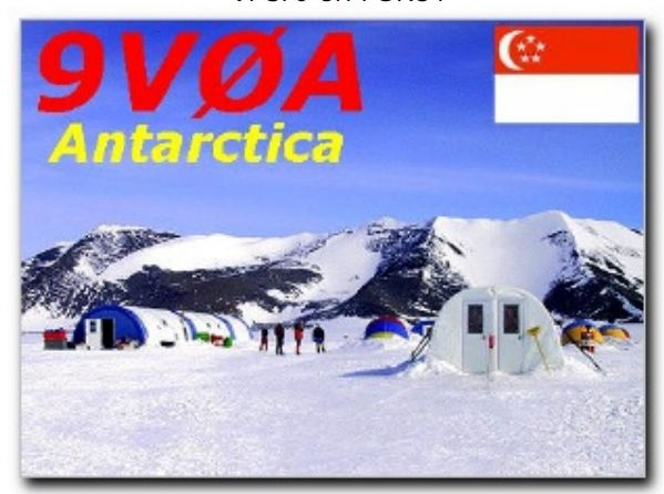
9V0A special callsign