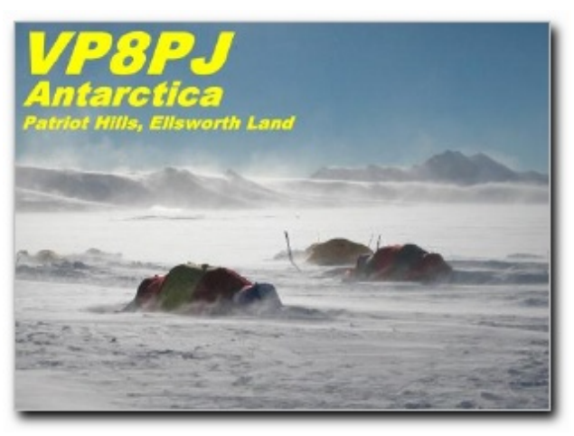
VP8PJ on PSK31

PACIFIC TOUR ---> Sara, HA9SD and Eli, HA9RE will be active from Tuvalu (OC-015) on 1-18 January (callsign TBA) and from Tonga (OC-049) as A35RE from 20 January to 4 February. They plan to operate CW and SSB on 80, 40, 30, 20, 15 and 10 metres with two stations. QSL direct only via HA8IB ("against 2 new IRCs or 2 US$"). [TNX HA8IB]