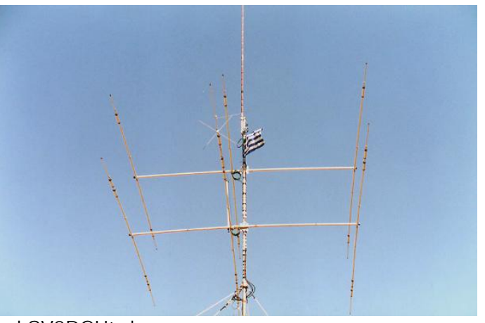
EURA Award and SV2DGH's beam