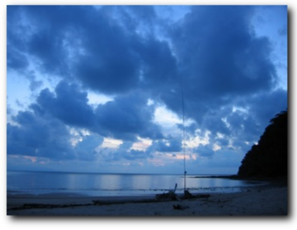
Pulau Muara Besar OC-165