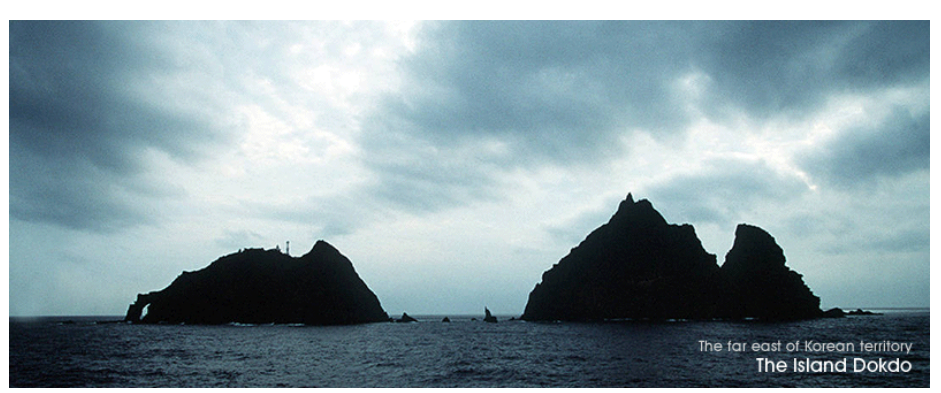
D77A from Tok Island (AS-045)

Edited by I1JQJ and IK1ADH i1jqj@425dxn.org