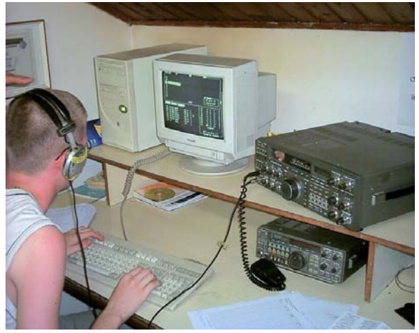
9A2004YC operation on 40m

YV - Neris, YV7QP (SSB and CW) from Margarita Island (SA-012).