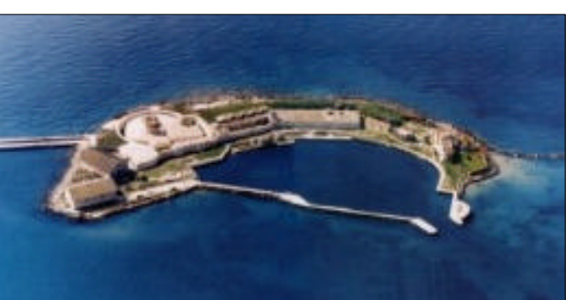
San Paolo Island (EU-073)

I - Matteo, IZ3HER reports he will operate on 20 and 40 metres SSB as IZ3HER/P from Crevan (EU-131, IIA VE-