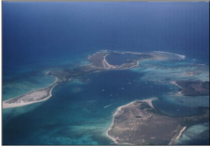
Los Roques (SA-035)