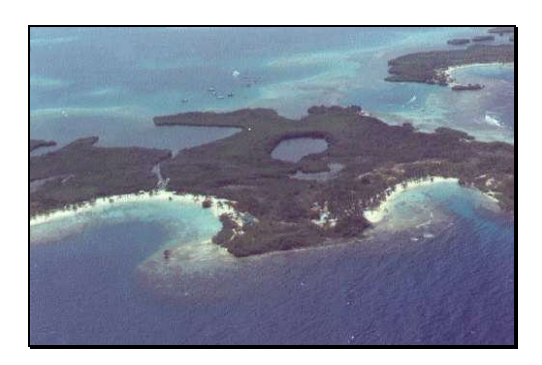
Cayo Sombrero (SA-089)

YV - 4M5 DX Group (http://4m5dx.org/) members YV5WW, YV5OHW, YV5RED, YV1RDX, YV1CTE, YV5TX and YV5SSB will be active (SSB, CW and RTTY) as YW1DX from Cayo Sombrero (SA-089) on 27-30 July, IOTA Contest included. Before and after the contest they will concentrate on the WARC bands. QSL via IT9DAA. The team is looking for sponsors/donors for this operation.