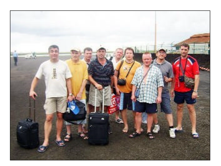
Arriving at Pago Pago, L-R: SV2BFN, YU1AU, RK3AD, YT1AD, UA4HOX, RA3AUU, UR0MC, YZ1BX, YU7NU

They will also operate on 60 metres (5403.5 kHz), 2 metres EME and 6 metres EME with WSJT65 A, B, C (50.375 MHz and 144.375 MHz). The pilot stations will be Toma/YU1AB (Europe), Lee/KH6BZF (Americas and Pacific) and Antic/YU1AA (Serbia and Eastern Europe). QSL via YT1AD. The website for the expedition is at <a href="http://www.yt1ad.info/n8s/index.html">http://www.yt1ad.info/n8s/index.html</a>