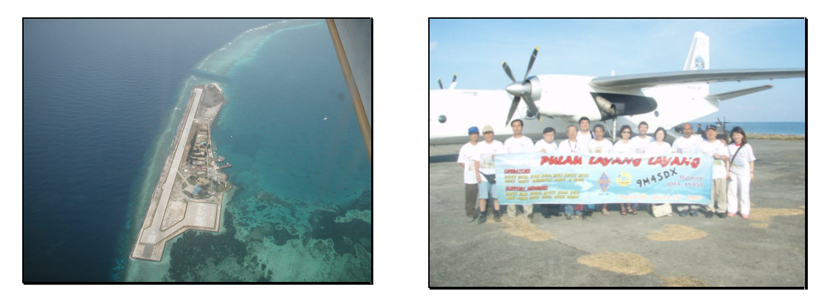
Layang Layang, Spratly Islands (AS-051) and the 9M4SDX team

I The 9M4SDX (Spratly Islands) log is available at <a href="http://9m4sdx.dxers.net/log_search/search.html">http://9m4sdx.dxers.net/log_search/search.html</a>