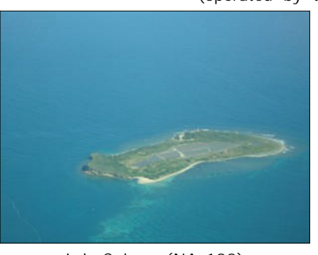
Isla Cabras (NA-122)