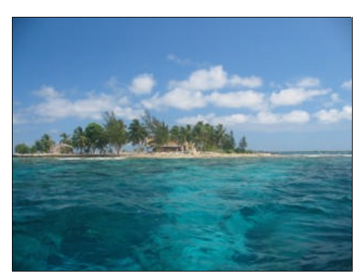
Little Cay (NA-057)

HR - A group of operators from the Radio Club de Honduras (<a href="http://www.qsl.net/hr2rch">http://www.qsl.net/hr2rch</a>) will be active as HQ9L from Little Cay, Bahia Islands (NA-057) on 4-6 May. They will operate SSB. CW and digital modes on 160-10 metres. QSL via HR2RCH, direct or bureau. [TNX www.rsgbiota.org]