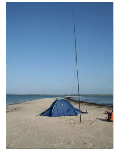
C50C from the Bijol I slands

{\sf HSOZHR~I~Eric} , SM1TDE/HS0ZHR reports he is back in Sweden, as he has had to leave Thailand much earlier than planned [425DXN 854].