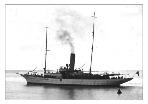
Marconi's yacht "Elettra"