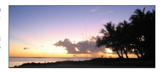
Dawn on Taku'u