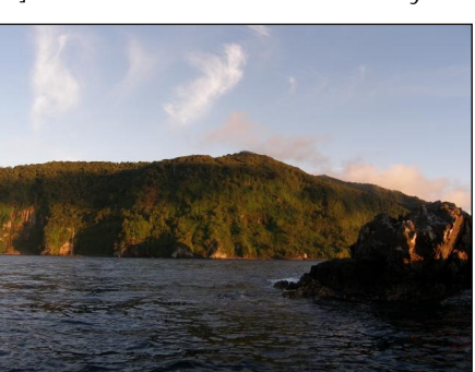
Isla del Coco (NA-012)

VP2M - George/K2DM (VP2MDG), Peter/K3ZM (VP2MMZM) and Glen/W4GKA (VP2MKA will be active from Montserrat on 24-30 October, including a M/2 entry in the CQ WW DX SSB Contest as VP2MDG. Look for VP2MDG on 6m SSB and VP2MZM on 160m CW outside the contest. QSL via home calls. [TNX ARRL DX Bulletin] VP5 - WA2VYA, K2WB, W2WAS, N2VW will be on Providenciales, Caicos Islands (NA-002) on 23-30 October. They will participate in the CQ WW DX SSB Contest as VP5T (QSL via N2VW, direct or bureau; logs will be uploaded to LoTW after 30 days). Before and after the contest they will operate CW, 30, 17 and 12 metres as homecall/VP5 (QSL via home call). [TNX NG3K]