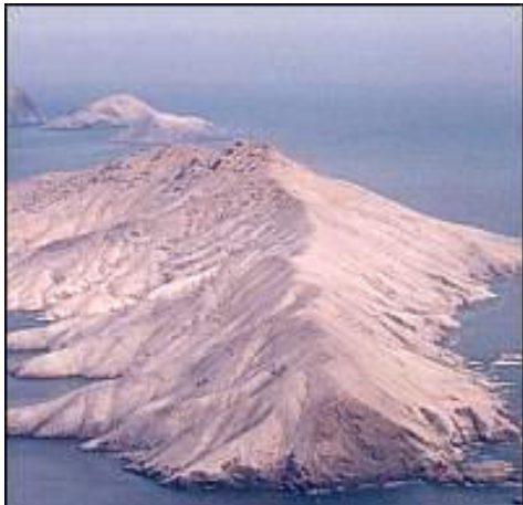
Isla Blanca (SA-098)

OZ - DF8AE, DF8XC, DK5QN, DL1YDI and DL1YAW will be active as 5P3WW from Vendsyssel-Thy/Nordjylland (EU-171) on 20-27 November, CQ WW DX CW included. They will have three stations and will operate SSB, CW and digital modes. QSL via DL1YAW, direct or bureau. [TNX www.rsgbiota.org]