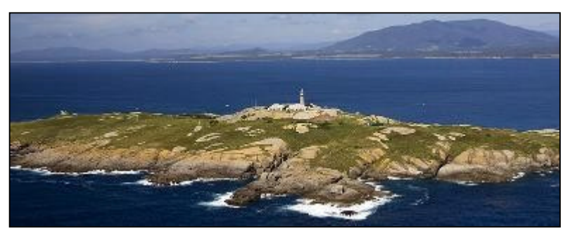
Montague Island (OC-223)