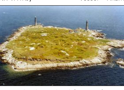
Thacher Island (NA-148)