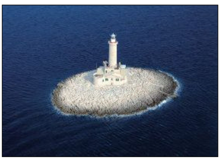
Porer Island (EU-110)

9Q - Philippe, 9Q1TB (F5LTB) is going to leave the Democratic Republic of