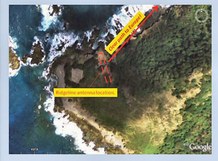
The KP1-5 Project will appreciate the support from each and every European ham as they prepare to activate KP5! Please visit their website (<u>www.kp5.us/help.htm</u>) to support this DXpedition