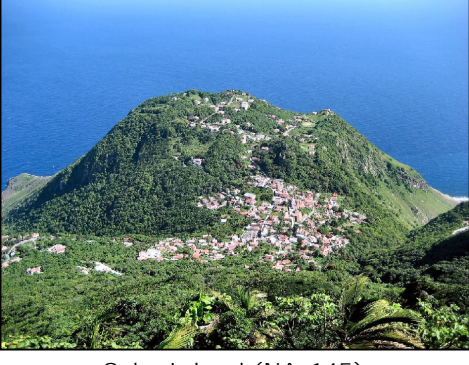
Saba Island (NA-145)

wire. QSL to Christian Saint Arroman, Chemin de Mouteguy, 64990 Urcuit, France. [TNX The Daily DX] UA - A few activities for the World Flora Fauna Award are expected to take place between 3 and 8 January. Look