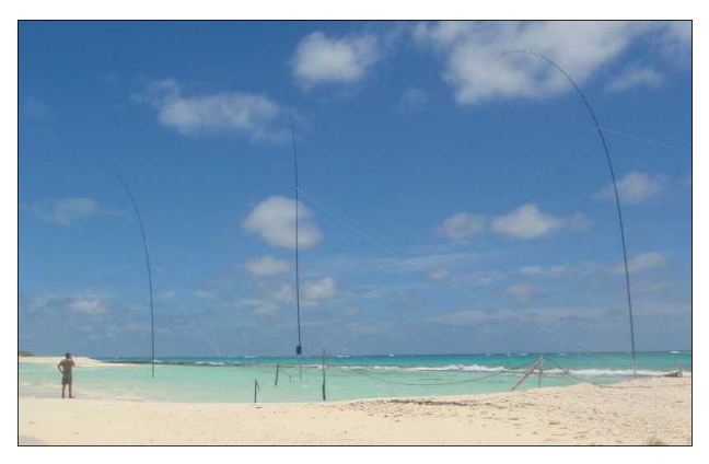
The verticals at TX3A

FK/C - George and Tomi dropped anchor in the lagoon of Chesterfield (OC-176) in the local morning of 2 November and became QRV at 11.17 UTC on the 3rd. As a reminder, while TX3A will not disregard the higher bands, this expedition is heavily focussed on the low bands. On 160 metres look for them on 1830.5 kHz, listening below 1825 for Japan and above 1825 kHz for the rest of the world. QSL via HA7RY. Updates and log search (currently 2922 QSOs until 21.05 UTC on 5 November) can be found at http://tx3a.com/