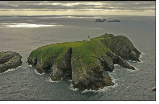
GS0INT: Flannan Isles (EU-118)