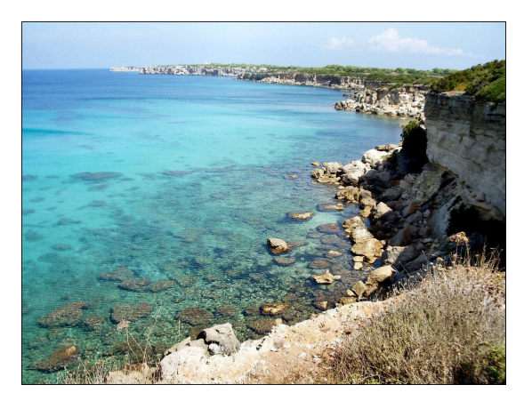
IA5/IQ5LV: Isola Pianosa(EU-028)

IV3IUM, direct or bureau. Information on the relevant award can be found at <a href="https://www.iv3ium.it/freccetricolori/index.htm">www.iv3ium.it/freccetricolori/index.htm</a> [TNX IV3IUM]