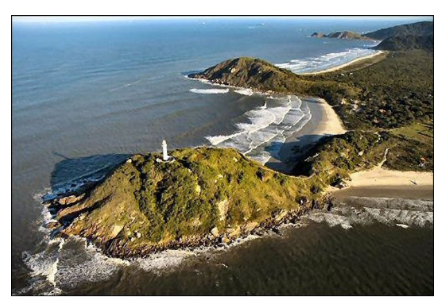
PR5D: Ilha do Mel (SA-047)

PY - Orlando PT2OP (ZX8C, mainly SSB) and Fred PY2XB (ZX8W, mainly CW) will be active from Cotijuba Island (SA-060) on 2-5 July, including the World Lighthouse On The Air (WLOTA) Contest. QSL ZX8C via PT2OP, QSL ZX8W via PT7WA. [TNX PT7WA]