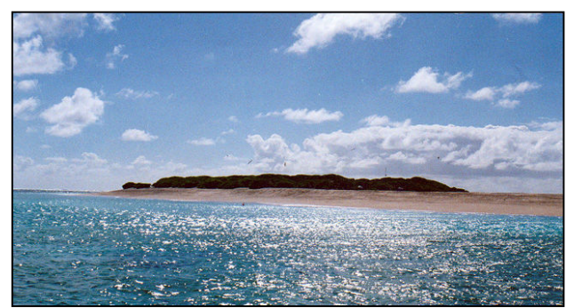
Conway Reef (Ceva-I-Ra)

either direct and bureau cards will be activated on Club Log), and LoTW "within 6 months after the DX operation". Further information can be found at http://hb9fr.ch/3b9sp