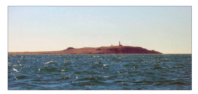
Isla Pinguino (SA-087)