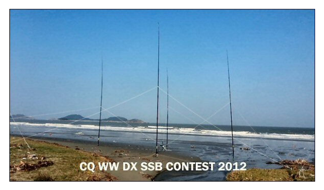
D9K, Pigum Island (AS-060)

GU - Members of the Guernsey Amateur Radio Society and Guernsey RAYNET group will set up a station to take part in the 55th Jamboree On The Air (JOTA) on 20-21 October. Look for GB2JTA to be active from Guernsey (EU-114) on the HF and VHF bands as conditions permit. QSL via bureau or direct to the address on qrz.com