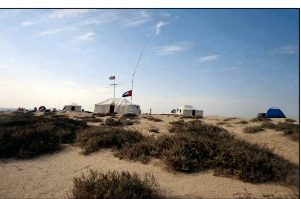
A63HI on IOTA AS-021

9M6 - "Disappointed with the current poor conditions and high noise level at my home QTH", Steve, 9M6DXX will spend the weekend of 8-9 December at a seaside hotel where he will be able to put up vertical antennas by the sea. Look for him to operate SSB only with 400 watts on 80-10 metres, including a part-time participation in the ARRL 10 Meter Contest. He will be checking 80m for Brazil, northern South America, the