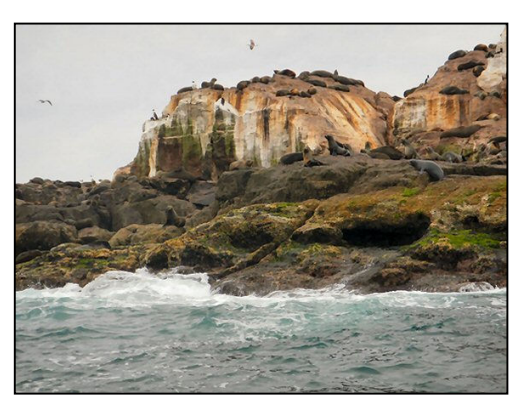
Isla Escondida (SA-096)

LU - The LU6W team will meet in Puerto Madryn on 31 December. They hope to be operating from Isla