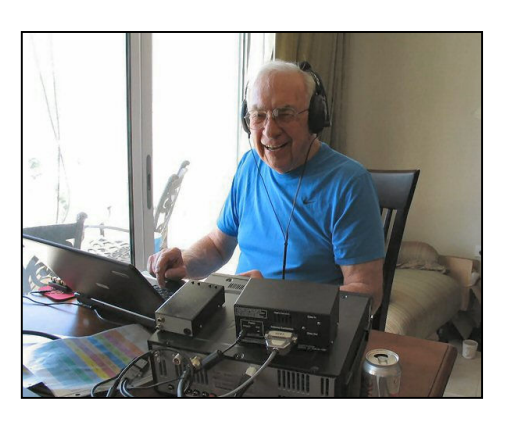
W60SP @ PJ7E