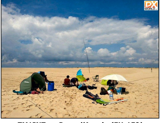
TM1INT on Banc d'Arguin (EU-159)