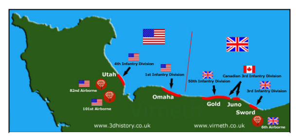
The D-Day landings (6 June 1944)