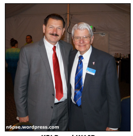
K3LP and W1JR

The CQ DX and Contest Halls of Fame honor those amateurs who not only excel in personal performance in these major areas of amateur radio but who also "give back" to the hobby in outstanding ways.