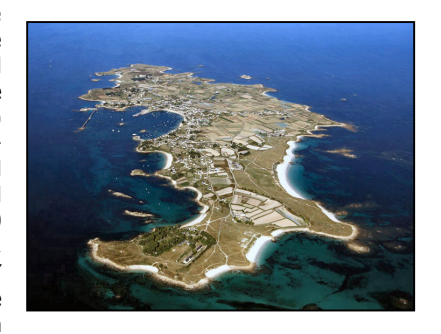
Ile de Batz (EU-105)

F - TM6NB is the callsign the Belgian team will be using from Ile de Batz (EU-105) 14-18 Sepon tember [425DXN 1261]. They will operate 80-10 metres SSB, CW, PSK and RTTY with two or three stations. QSL via ON4ANN, direct or bureau, and