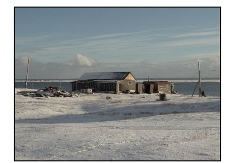
Wrangel Island (AS-027)

The ship is due to return to Arkhangelsk in early November. QSL for all callsigns via UA4WHX, see qrz.com for instructions. Updates and pictures will appear under each callsign on grz.com and on DX-World.net.