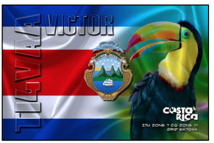
RIOFF (AS-025), RIOQ (AS-152), T6AA, T77C, TG9ADM, TI4VAA, TM13COL, TZ1CE, UK8ZC, VK100AF, VK9XX, VP9EME, XT2AW, XV1X, YI1SAL, Z37CXY, ZD7JC, ZS6WN.

QSLs received direct or through man agers: 4L6QL, 5W1SA, 6O1OO, 7D5RI (OC-245), 7Q7RU, 7X2AC, 9Q1C, 9X2AW, A25RU, A71CT, AA1AC (NA-031), AF2F/W4 (NA-067), B4CRA, BG2AUE, BY2CRA, C92RU, D44TWO, DT8A, E51WL (OC-082), FR8TG, FY4PU, FY5FY, GB13COL, GR2HQ, HV0A, JT1CO, K4D (NA-085), KL7FBI (NA-037), KT3Q/4 (NA-142), NL0H (NA-040), ODSET, ODSEU, OHOZ, PJ2MAN, PJ4KY,